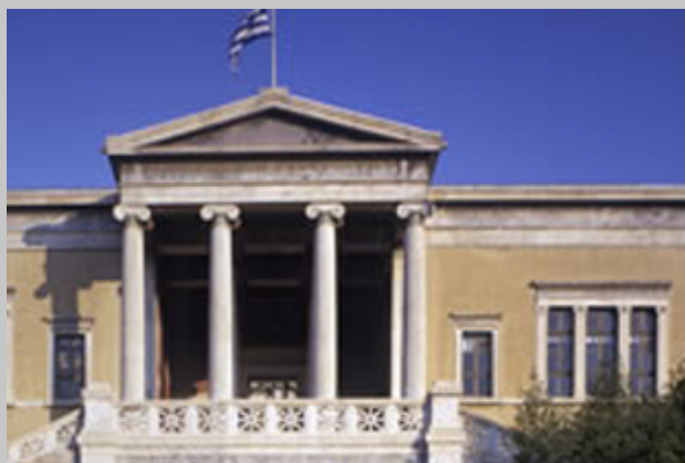
Figure 1: National Technical University of Athens, Greece.

Venue: National Technical University of Athens, Greece.