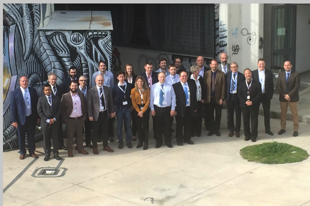
Figure2: Equinox partners during 1st Kick-Off meeting of project.